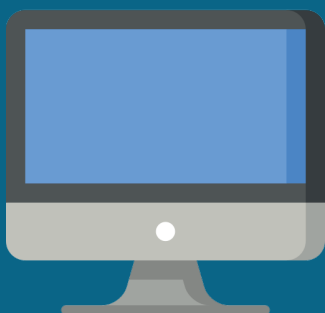
THE MYLOFTUS WEBSITE.

FAILURE TO GAIN THIS APPROVAL IS A CONTRAVENTION OF THE COVENANTS ATTACHED TO YOUR PROPERTY, WHICH COULD AFFECT ANY FUTURE SALES.