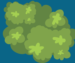
MAINTAINING YOUR PLANTS

THE GARDEN TEAM CAN OFFER GUIDANCE AND ADVICE BEFORE YOU MAKE ANY PURCHASES.